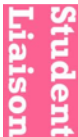
Vacant Student Liaison