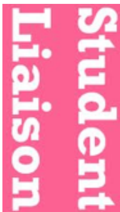
Vacant Student Liaison