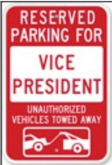
Vacant 1st VP/Education