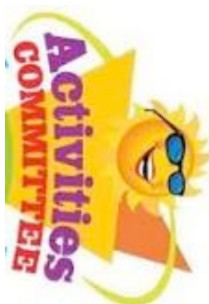
Vacant Social Activities