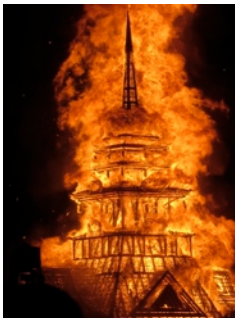
Temple burnt Sunday