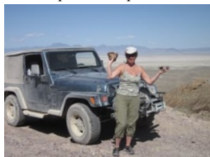
This is HPY ZED (my playa name)