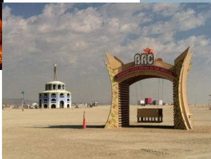
The Man (burnt Saturday) and Reno Core Project (burnt Thursday) with Burn Walls Street (burnt Friday) in the background. I was Project Lead for the RCP.