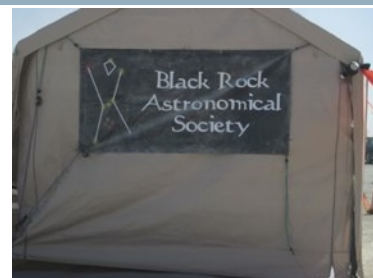
Our theme camp